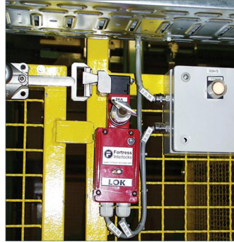
SBS1LOK ; solenoid controlled safety gate switch with safety key and sidebar